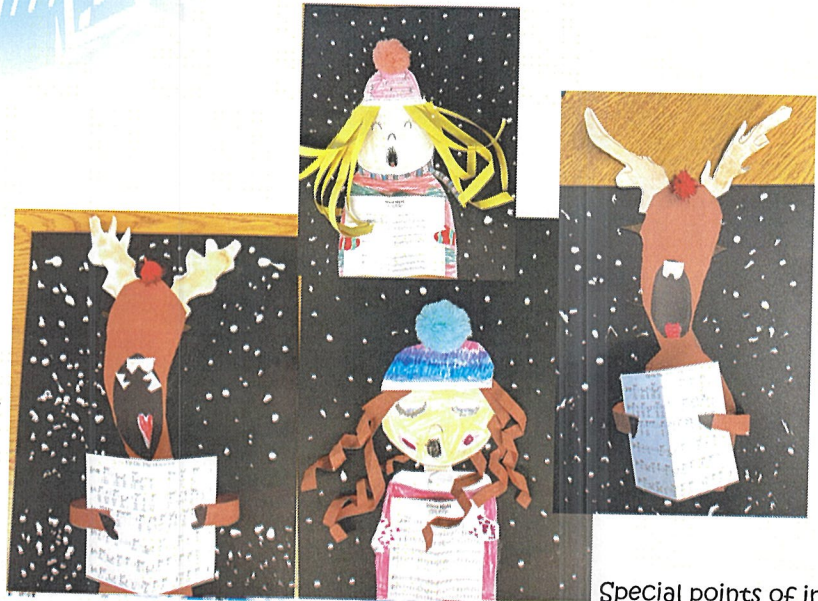
Carolers and Singing Reindeer Art

thoughts in a logical sequence, applying and checking for capitals and periods, and add some adjectives throughout. The focus for the grade 3 students was capitals and periods are consistently used correctly throughout, a variety of punctuation used, apostrophes used properly with contractions, adjectives flowing throughout, written in a well organized manner.